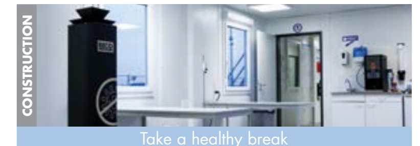
Take a healthy break